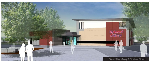
Gym / Main Entry & Student Quad