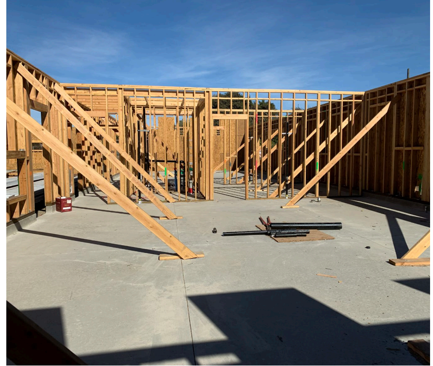
Framing of Kindergarten Building