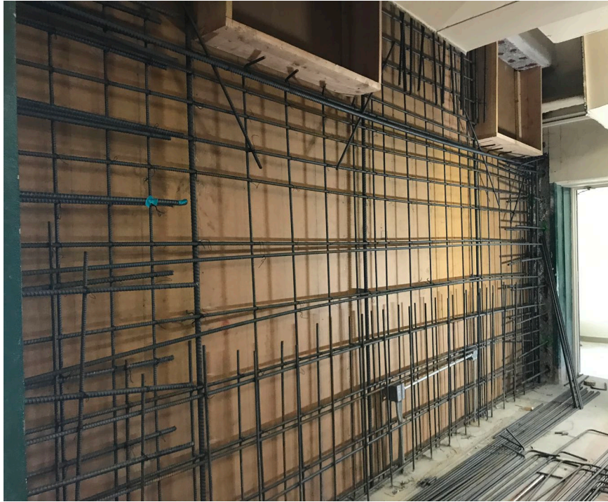
Concrete Shear Wall Girls Locker Room