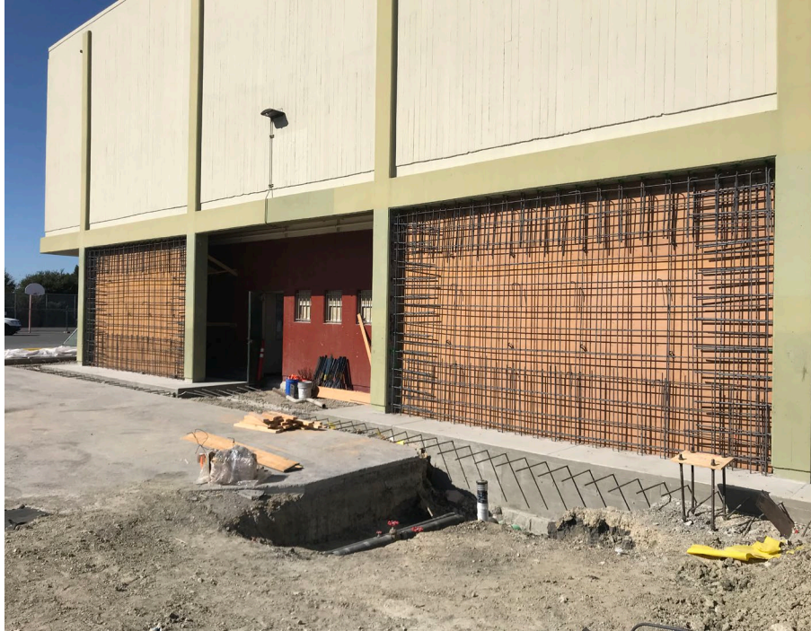
Gym Shear Wall