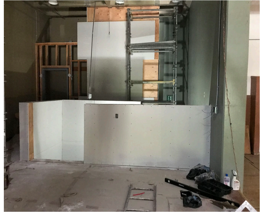
Wheel Chair Lift